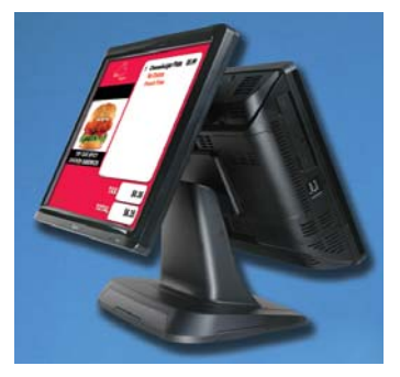
Optional Integrated 15" Rear LCD Customer Display (Reflection for Windows)