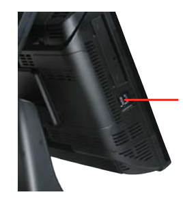
Two USB Ports on the Left Side