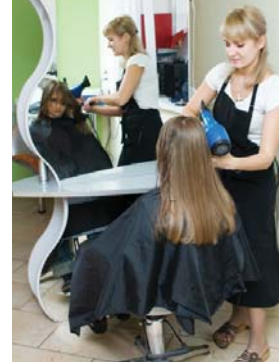
Convenience Stores / Salons