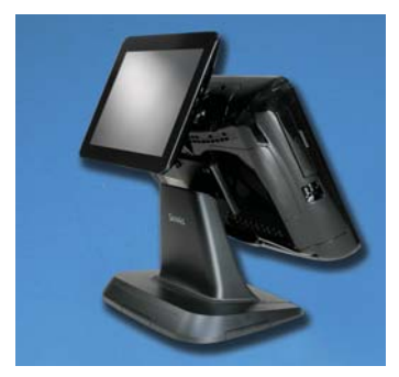
Optional Integrated 9.7" or 7" Rear LCD Customer Displays (Reflection for Windows)