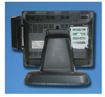
Tool-Free Access to Compact Flash or Hard Disk Drive Optimizes Serviceability